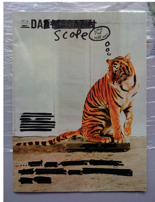
Invisible Heroes Special Project at SCOPE Basel Art Show 2009

Artfacts.net, Artnet, artnowonline, artprice, artslant, Art We Love – explore art on your own terms, Global Art Magazine, likeyou – the artnetwork, Miami Art Guide, MutualArt, re-title, Rivista Segno, Tommy Hilfiger, Whitehot Magazine, and Video Art Magazine.