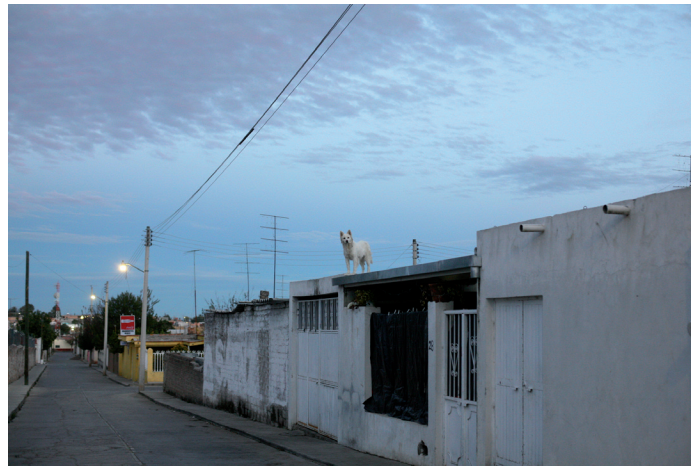
Mark Powell, White Fang, 2009 C-print, 70 x 100 cm Courtesy of Arróniz Arte Contemporanea

Bonelli Arte Contemporanea - Italian gallery Bonelli Arte Contemporanea brings the works of three artists to Basel this year. All three are either of Italian descent or are currently working in Italy, thus giving a good overview of the emerging Italian art landscape.